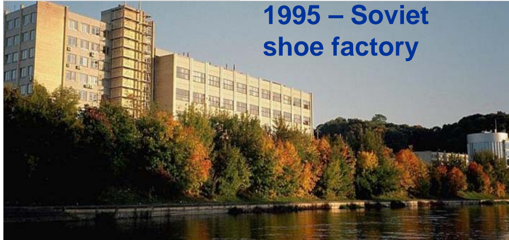
1995 – Soviet shoe factory