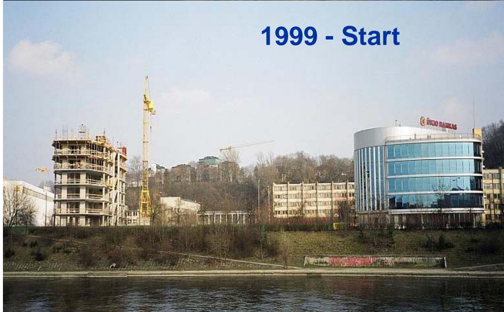
1999 - Start